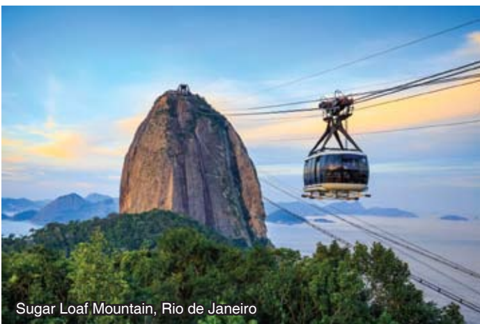
Sugar Loaf Mountain, Rio de Janeiro

Depart Foz do Iguassu, transfer to airport for your departure flight. (B)