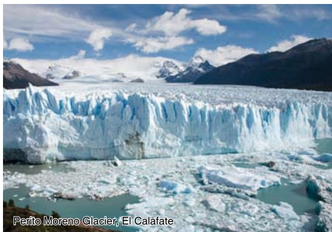
Perito Moreno Glacier, El Calafate

Depart El Calafate, transfer to airport for your departure flight. (B)