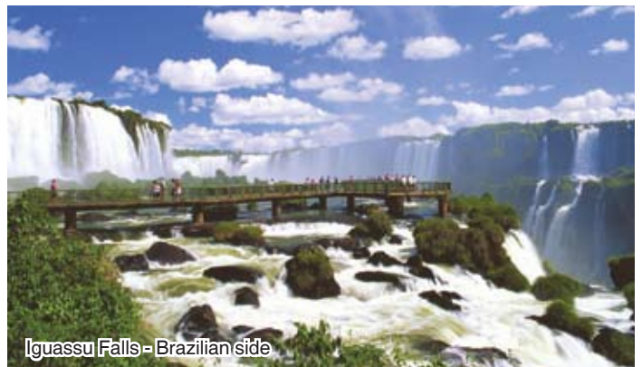
Iguassu Falls - Brazilian side