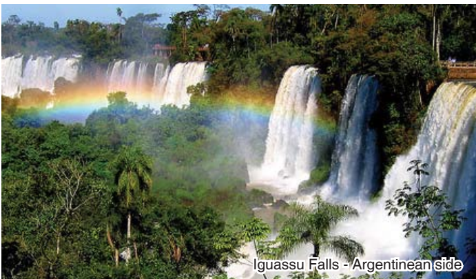
Iguassu Falls - Argentinean side