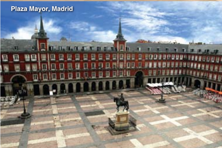
Plaza Mayor, Madrid