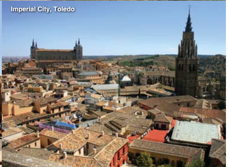
Imperial City, Toledo