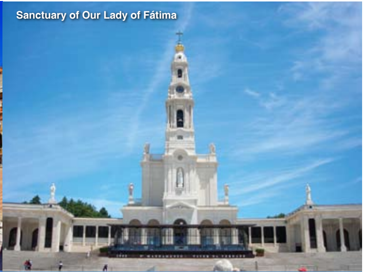
Sanctuary of Our Lady of Fátima