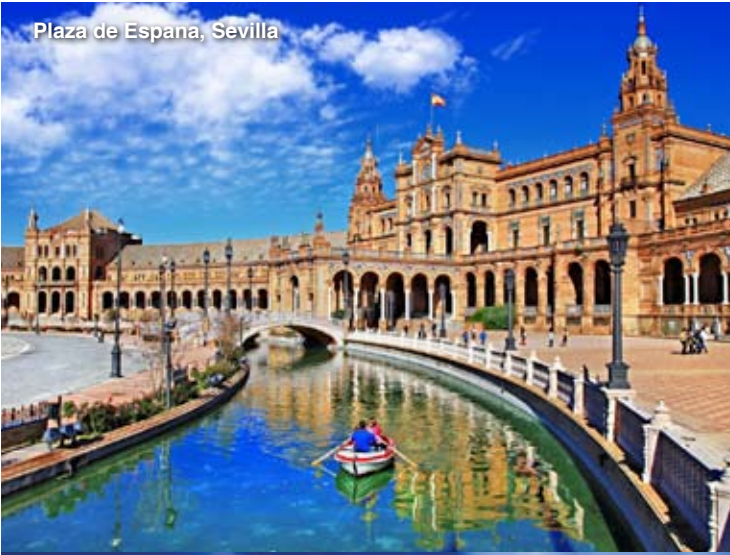
Plaza de Espana, Sevilla