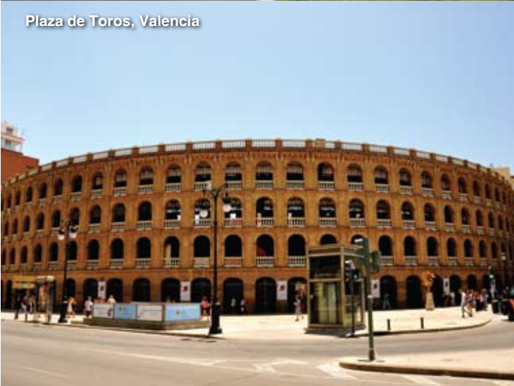
Plaza de Toros, Valencia