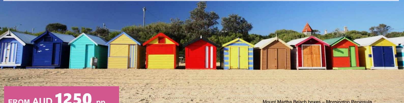
Mount Martha Beach boxes – Mornington Peninsula